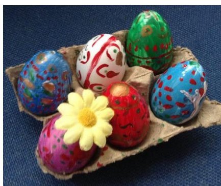
2 nd Molly Y2