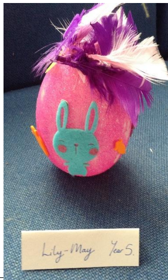
1 st Lily-May Y5