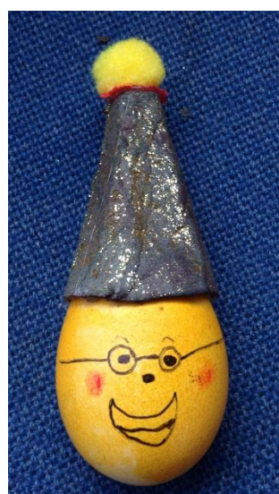
3 rd Scarlet Y4