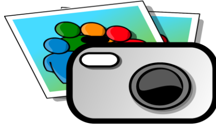
Photo Consent Forms – It's that time of year when we need to ask for the annual photo consent form to be filled in and returned to school. A paper copy will be sent home but also please find attached to newsletter.